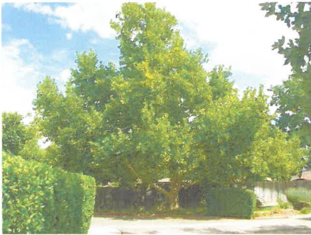
Tree view from our driveway