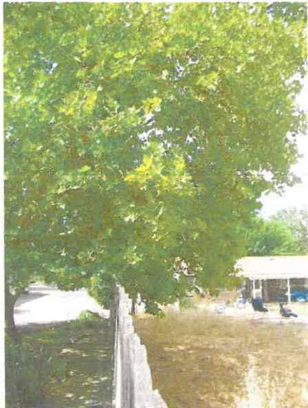
Tree view from the fence line. Our property is on the left.