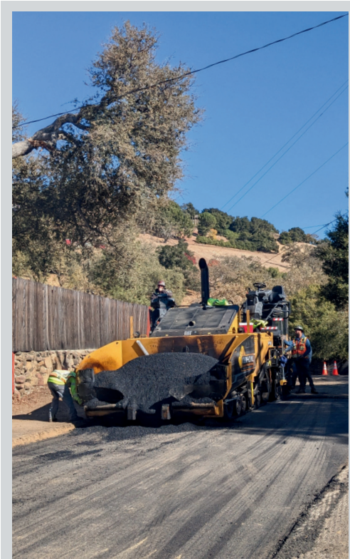
Monita Rd. Rehabilitation